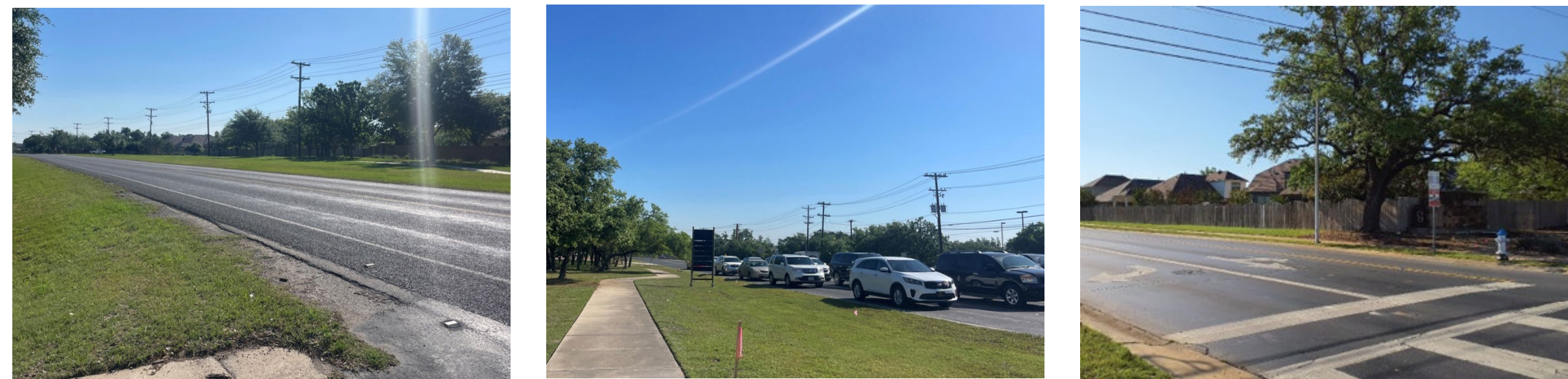
Existing Shell Road